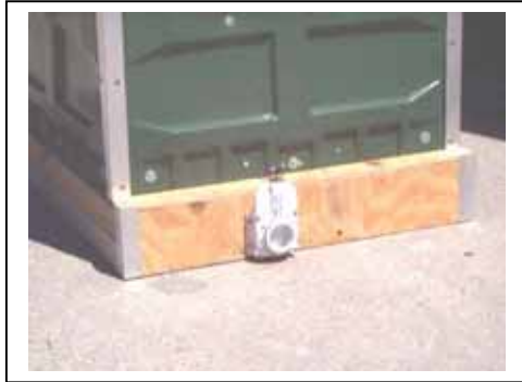
Dump Valve Model GJDV 350